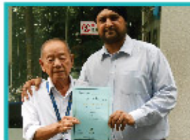
Team Award Level Z Quarter 4 (Oct- Dec 2013)