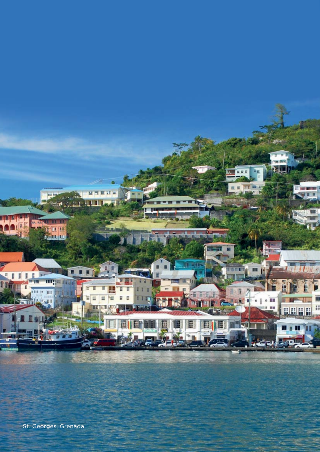
St. Georges, Grenada